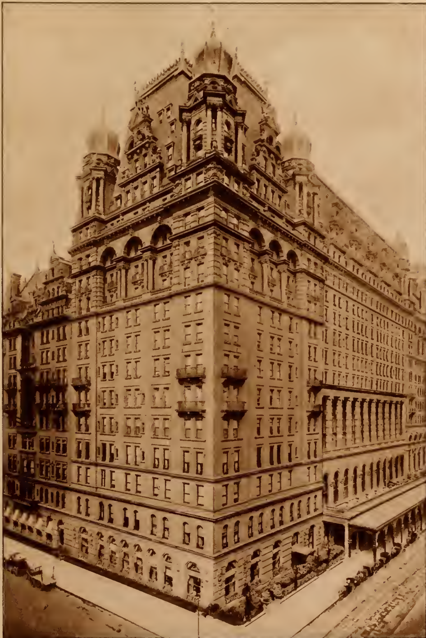
WALDORF-ASTORIA HOTEL. Situated on Fifth Avenue between 33d and 34th Streets. When built was famed as finest hotel in America. Contains 1400 rooms.